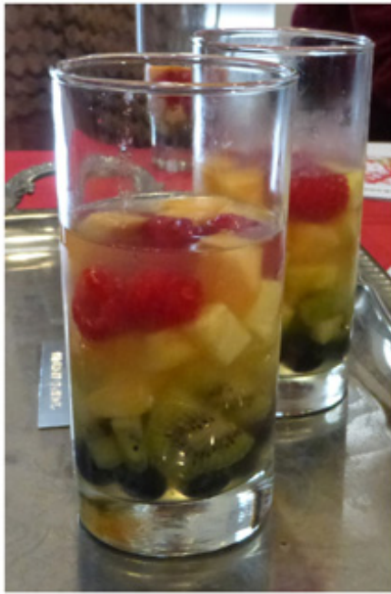
← Rainbow Sangria