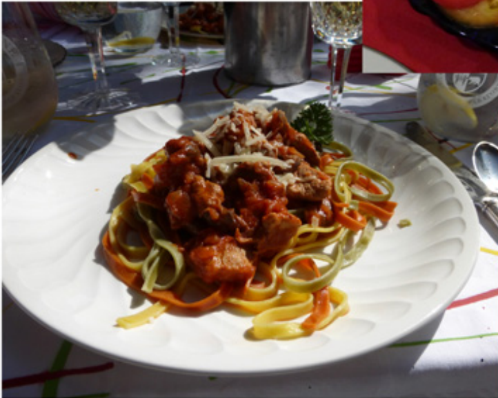
Jackson's Famous Spaghetti Sauce