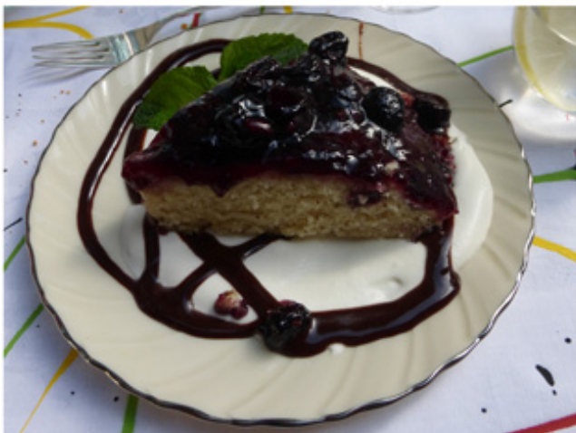
Upside Down Cherry Cake