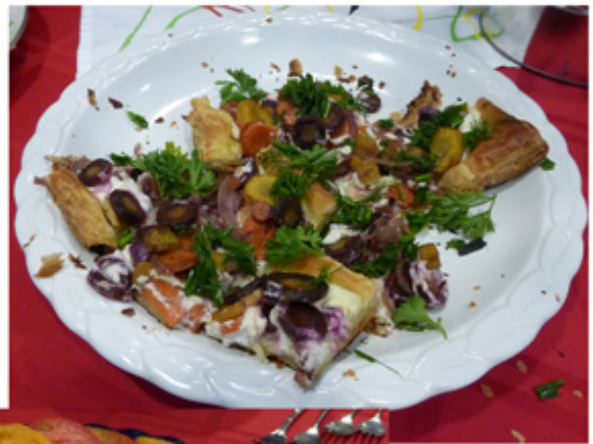
Carrot Tart →