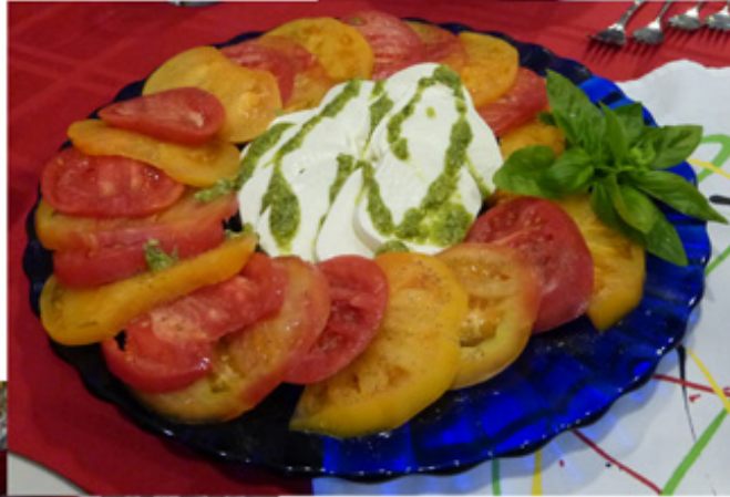
Tomatoes & Mozzarella