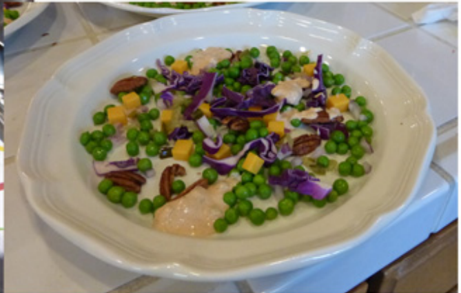
Pea Salad with Russian Dressing