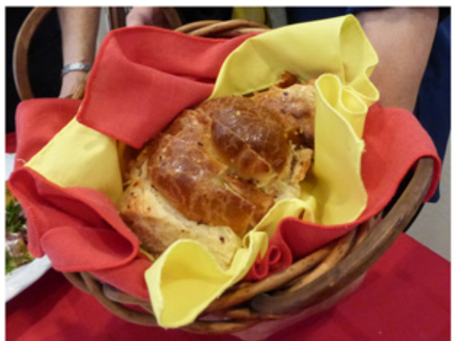
Spicy Cheese Bread